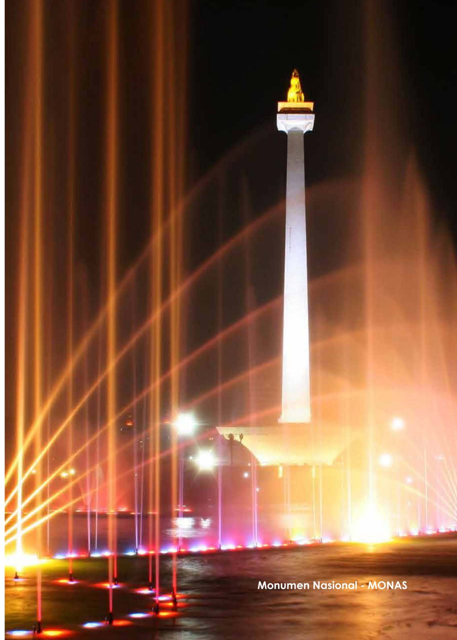
Monumen Nasional - MONAS

■ Please Fax this form to secretariat Fax: +62-21-6386 9503/319 03219