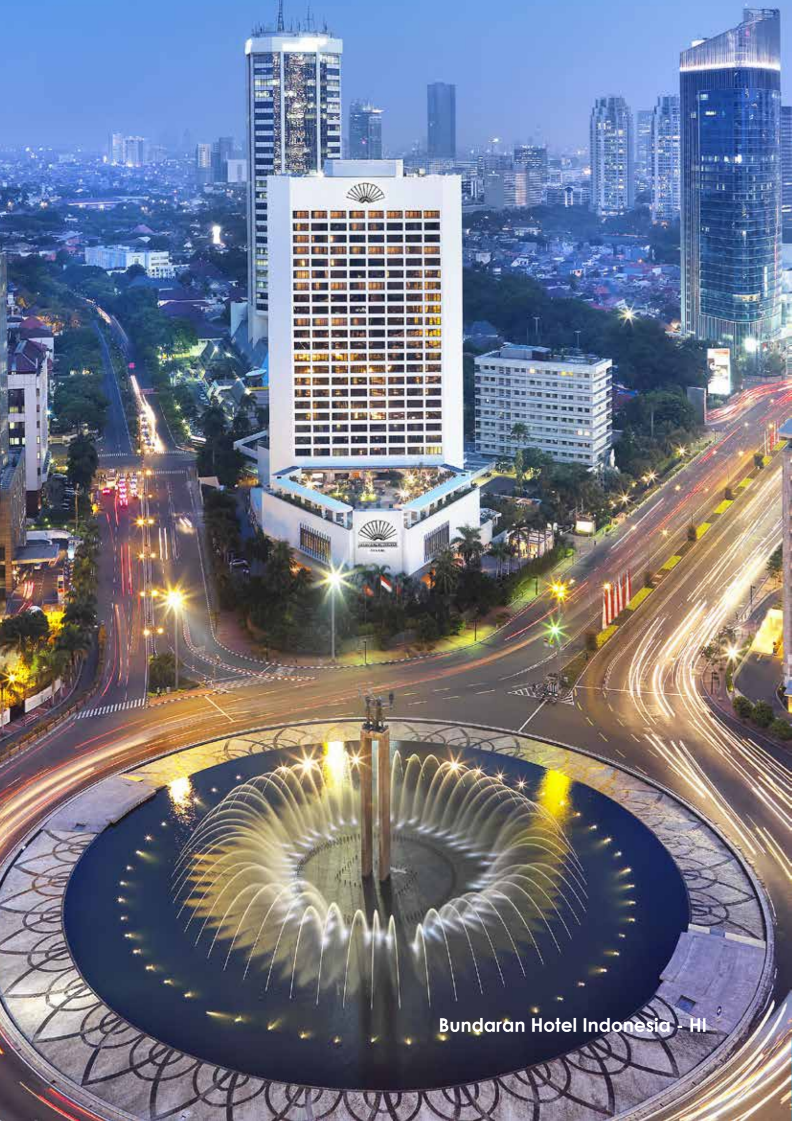
Bundaran Hotel Indonesia - HI